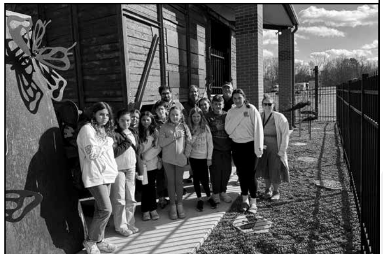
BZ's Kadima youth group visit to the Children's Holocaust Museum in Whitwell, TN.